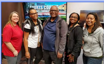
Classroom and Home: Real Life Solutions for Real Life Problems" Conference.